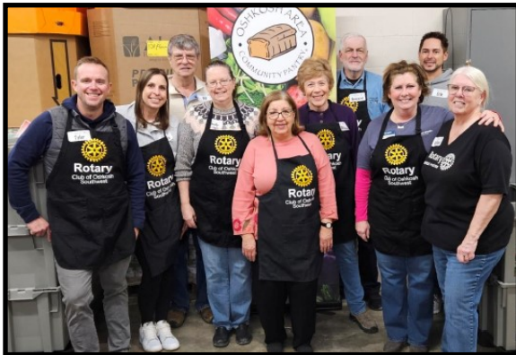
Members of Southwest Rotary stocked shelves at the Oshkosh Area Community Pantry on February 24.